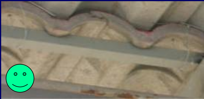
Tiles tied to steel battens (Thailand)