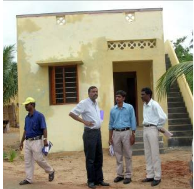
Standard House, Villupuram, India