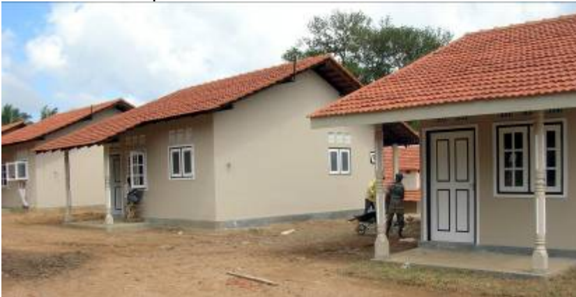
“500 sq.ft” House Galle, Sri Lanka

Amongst the Consultants’ recommendations is the suggestion that contingency planning for future disasters should include the advance preparation of suitable standard affordable housing drawings. Partner Housing Australasia needs the assistance of experienced architects and house designers, to prepare standard drawings of affordable housing, to be used in disaster relief as required throughout the Asia-Pacific area – Can you help?