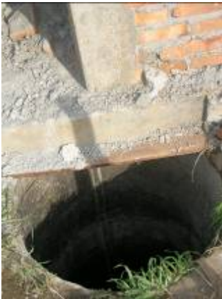
Wall built over Septic Pit

During the course of inspecting a group of houses, the Consultant was asked by the client’s representative to give an opinion on the suitability of construction of one particular house. They were accompanied by a reasonable crowd, including the home owner, the subcontract builder and some very vocal local people. The problems with the particular house were several: